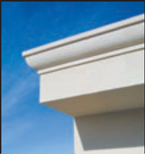
parapet with cornice